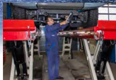
Maximum vehicle access