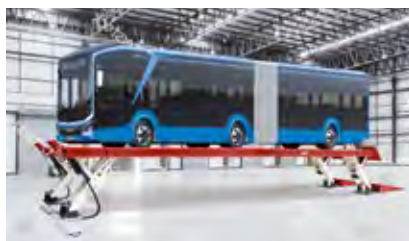
Platform lengths up to 14.5 metres