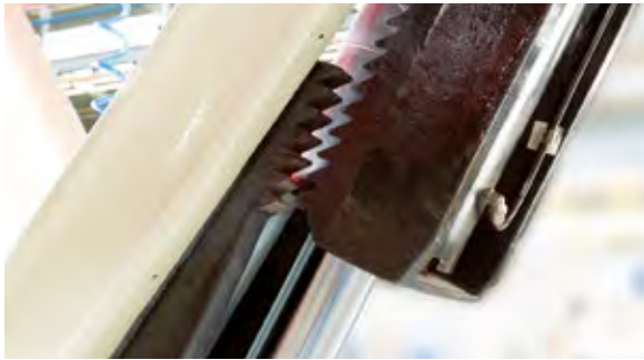
Mechanical Locking System

The mechanic can work ergonomically and safely standing upright under the vehicle. A toolbox trolley and other workshop equipment can easily be moved under the platforms.