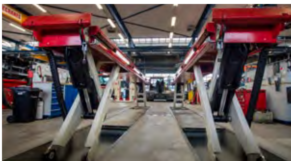
Automatic Recess Cover Plates