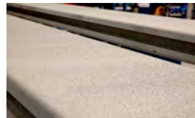
Stertil® Guard™ Anti-Skid Coating