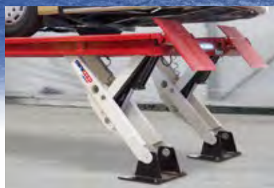
Easy access Y-shaped construction