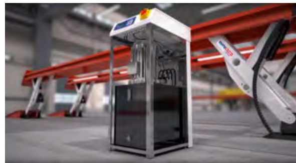
Removable side panels for easy maintenance