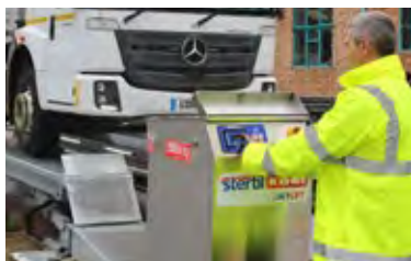
Stainless steel control console