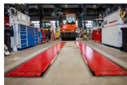
Flush mounted with Reverse Roll-Off

Safety is one of Stertil-Koni's top priorities. The automatic Reverse Roll-Off Protection System with optimum safety prevents the vehicle from inadvertently rolling-off of the lift. This system also effectively lengthens the platform lengths compared to conventional platform lifts. This option is available for all SKYLIFT models and can be fitted to existing installations.