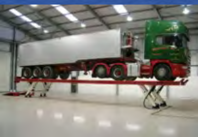
Completely vertical lifting operation

This makes Stertil-Koni the Number 1 in heavy duty vehicle lifting around the world.