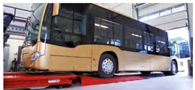
Fixed end-stops or "drive-thru" versions