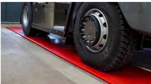
Flush with the floor and ideal for low clearance vehicles

Flush mounted, semi-flush mounted, or surface mounted each model is possible with the SKYLIFT. This heavy duty vehicle lift is suitable for a wide range of vehicles and workshop situations.