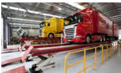
Various platform lengths

With a special synchronisation set and a bridging-piece between the two lifts, it is possible to use two SKYLIFT vehicle lifts safely and quickly as either a single long lift or simply as two individual lifts. The drive-on is just as safe and equally smooth as with a single configuration. This is due to the minimal amount of space between the two lifts.