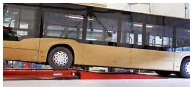
Versatile modular drive-on ramps