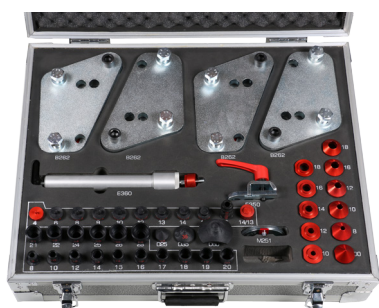
VAS 6600 Aluminum Holding Kit

Hold the PORSCHE vehicle securely on the alignment platform without damaging sensitive aluminum parts.