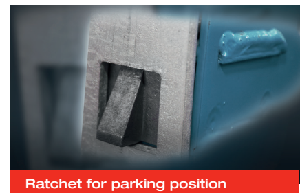
Ratchet for parking position