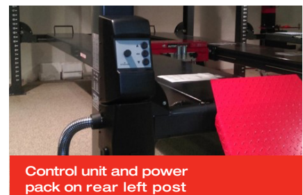
Control unit and power pack on rear left post